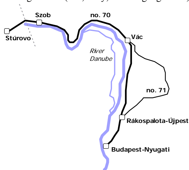
Fig. 1. Lines no. 70 and 71

Mainline no. 70 running along the river Danube is not just a suburban line but an important international link to Slovakia as well. It is double track, electrified, equipped with double direction automatic block control and the allowed speed is 100-120 km/h. Line no. 71 is single track, electrified and equipped with centralized traffic control (3 stations are remote controlled). The allowed speed is 60-80 km/h.